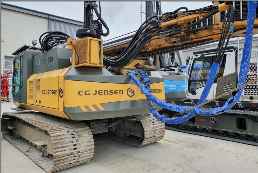
ABI Mobilram TM16/20

GREAT USED MACHINES AT REASONABLE PRICES WITHOUT COMPROMISING ON QUALITY