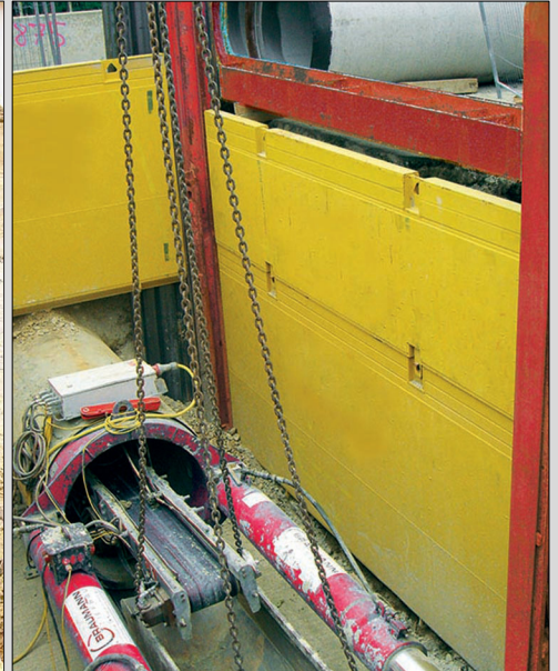
Pit and Shaft Shoring

Available as mini-box, midi-box and standard trench box The fastest shoring system for trench depths up to ~4.0 m