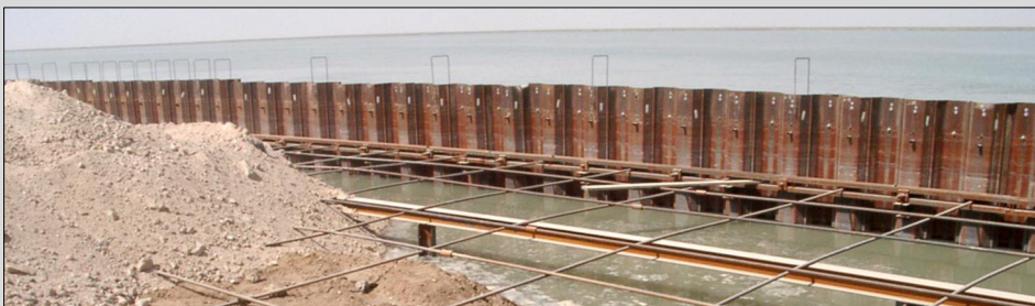
Sheet piles and Marine Tie Rods

By trench boxes, slide rails shoring, sheet piles or soldier piles