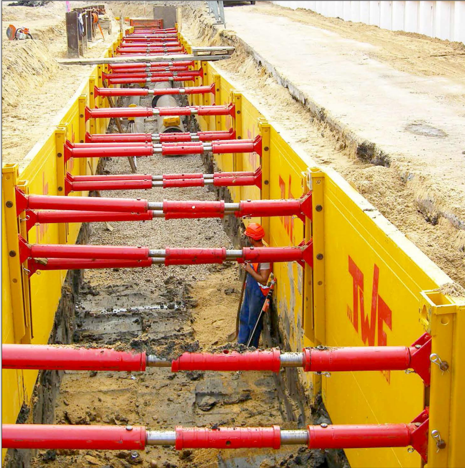
Steel Trench Boxes

IF PIPE LAYING IS YOUR BUSINESS WE RECOMMEND TO LOOK AT OUR EXTENSIVE RANGE OF SHORING EQUIPMENT