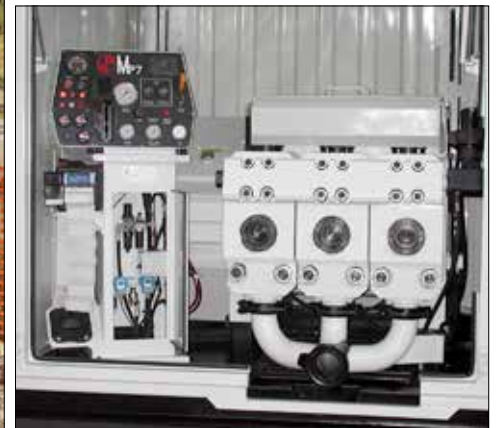
Low & High Pressure Grout Pumps

High capacity, skid and container mounted