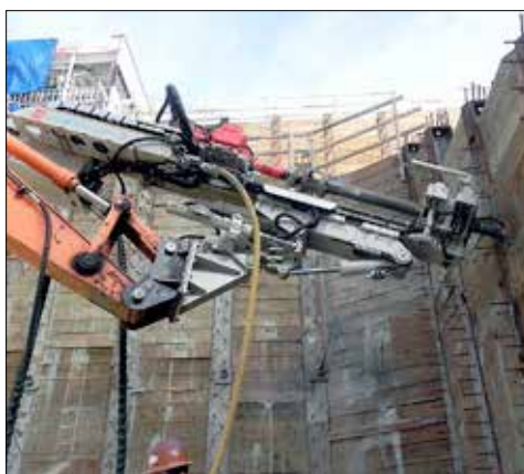
Drilling Masts (add-on drills)

For anchors, micropiles, jet grouting, etc.