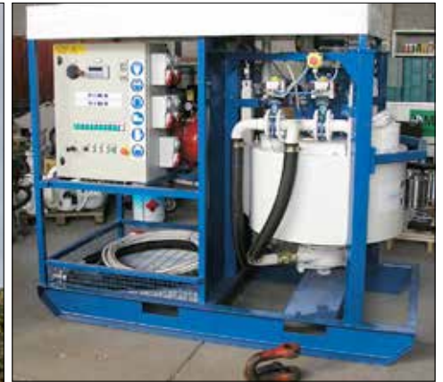
Grout Mixing Units

With single rotary, drifter, double rotary, in jet grouting configuration, etc.