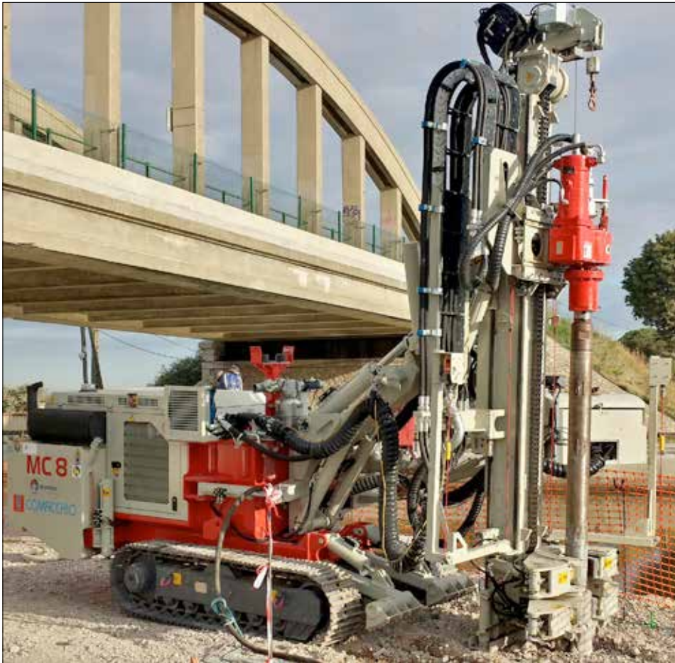
Hydraulic Crawler Drill Rigs

WE OFFER A WIDE RANGE OF EQUIPMENT FOR ALL POSSIBLE DRILLING, GROUTING AND JET GROUTING PROJECTS